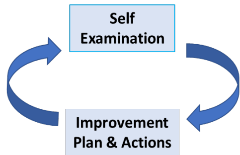
The Virtuous Performance Cycle

Most simply put, the CFM seeks objective feedback on two questions for each stakeholder in the church’s ministry: